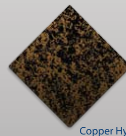
Copper Hybrid (Custom)